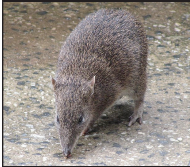
Southern Brown Bandicoot, Cranbourne