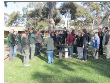
Members about to set off from Little Desert Lodge for a day exploring the natural history of the area, October 2011