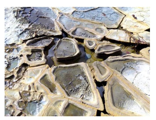
Patterns on the platform

On Saturday, 3 locations were visited: The Desalination Plant; Wonthaggi Wetlands and the Mouth of the Powlett River. At the Desalination Plant, members were impressed by the huge effort made to successfully revegetate the area with indigenous species. Even the roof of the main building had been turned into a grassy heathland. Wonthaggi Wetlands provided a natural oasis near the town centre with some fine trees and plentiful bird life. An echidna shambling along near the lunch spot provided one of the few mammal sightings. At the Powlett River, some members opted for a shorter walk, but those who rose to the challenge of the full circuit were rewarded with sightings of 2 Double-banded Plovers (early migrants from New Zealand) and several Hooded Plovers.