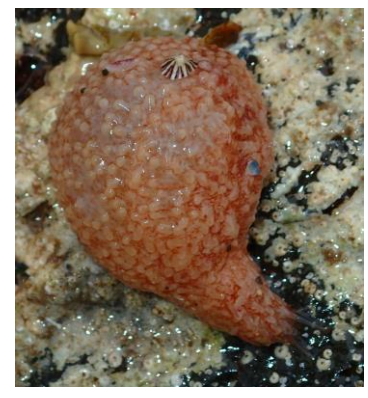
Lipotrapeza vestiens (Sea Cucumber)

Arriving at 10:30am and following the excursion briefing, we headed across the "stalk" of the mushroom to access the intertidal platform. Once on the reef, we quickly scanned for any bird life (that wasn't being blown away in the strong winds) then worked our way through the various rockpools. Led by Cecily, Joan and Carol, who have long been interested in all things marine, we combed the rockpools for interesting creatures. It wasn't long before there was much excitement around the numerous brittle sea stars we were finding – almost under every rock! We also found cushion stars, elephant snails, flat worms, crabs, and an especially beautiful Meridiastra gunnii (Purple Sea Star).