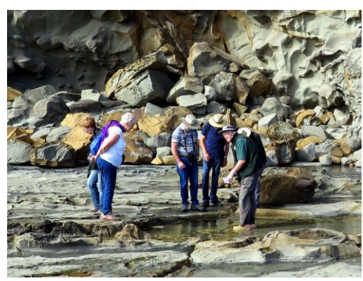
Exploring the Kilcunda rock platform

On Friday afternoon, a walk was taken from the Retreat across Kilcunda's famous trestle bridge, then returning via the beach. The cliffs and rock platforms provided much geological interest and the numerous rock pools contained a diversity of marine life, including anemones, chitons and elephant snails. In the evening, a meeting was held at the leaders' accommodation, "the Cottage", at which the Club's new projector was demonstrated to much acclaim.