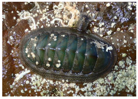
Ischnochiton australia (Green Chiton)