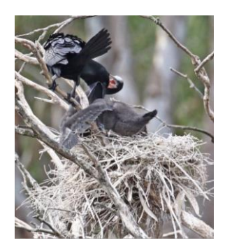
Some of the nesting waterbirds Little Black Cormorant (left) & Australasian Darter (right)

As we walked round the lake, Australian White Ibis were to be seen nesting everywhere, but among them were to be found nesting Australasian Darters, Little Black and Little Pied Cormorants. Two Royal Spoonbills were seen in a treetop, but we were unable to make out whether they had a nest there or not.