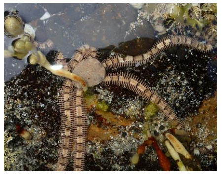
A Brittle Sea Star

Arriving at 10:30am and following the excursion briefing, we headed across the "stalk" of the mushroom to access the intertidal platform. Once on the reef, we quickly scanned for any bird life (that wasn't being blown away in the strong winds) then worked our way through the various rockpools. Led by Cecily, Joan and Carol, who have long been interested in all things marine, we combed the rockpools for interesting creatures. It wasn't long before there was much excitement around the numerous brittle sea stars we were finding – almost under every rock! We also found cushion stars, elephant snails, flat worms, crabs, and an especially beautiful Meridiastra gunnii (Purple Sea Star).