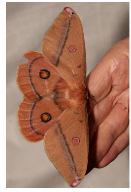
Opodiphthera helena (Emperor Gum Moth)