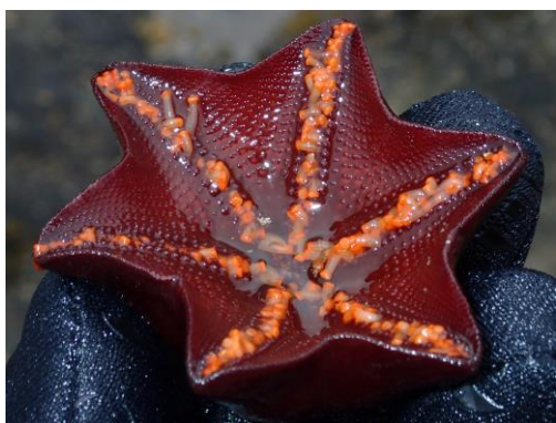
Meridiastra gunnii (Purple Sea Star)

After spending around 2 hours out on the reef, we headed back to the carpark and had lunch in the shelter of the dunes. It was starting to get quite chilly by then and even a beanie made an appearance! As we finished lunch it started to spit with rain so a walk on the beach was unanimously declined and we all headed home.