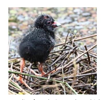
Australian/Purple Swamphen chick