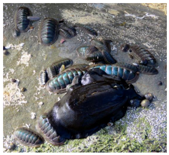
Chitons and Elephant Snails on upturned rock

The camp was concluded with dinner at the local pub followed by a get-together and birdcall back at the Cottage, where highlights of the weekend were discussed. The final tally for bird species seen came to a magnificent 81. It was unanimously agreed that it had been a most successful and enjoyable camp-out.