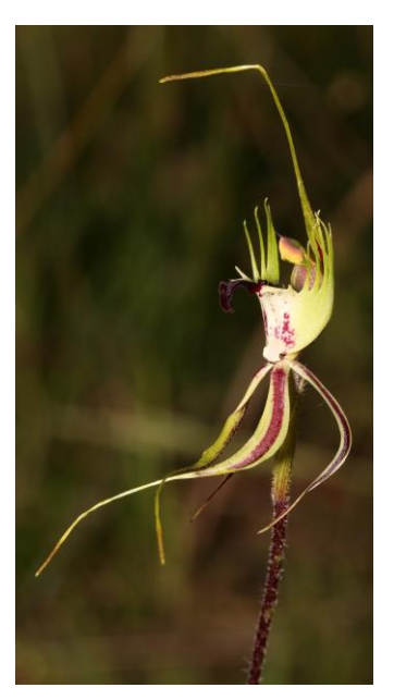
Caladenia tentaculata (Mantis Orchid)