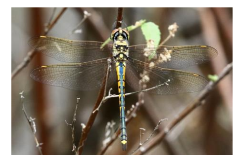
Tau Emerald Dragonfly