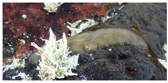
Notoplana australis (Flatworm)