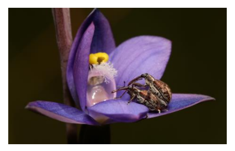
Thelymitra species with Weevils