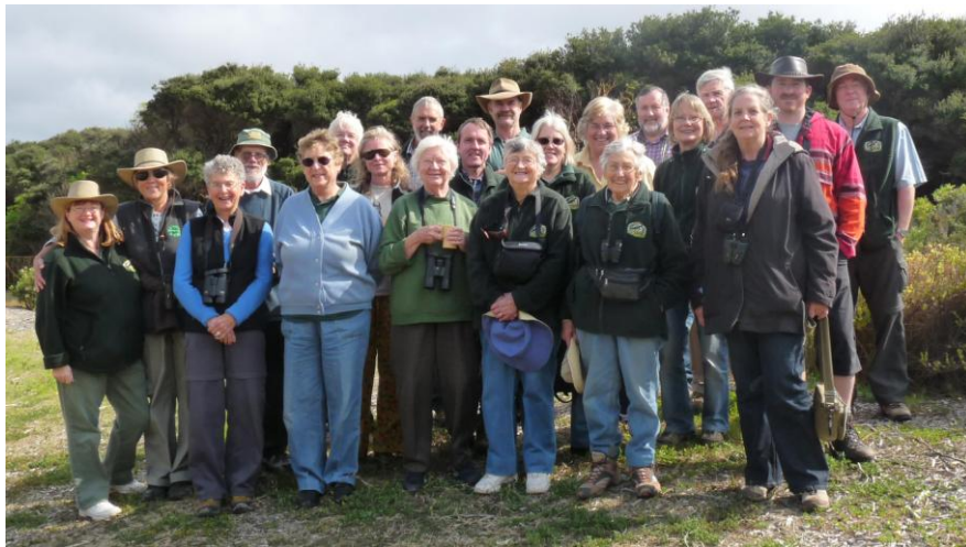
Anglesea October 2010 Weekend away