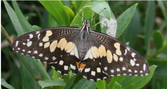
Chequered Swallowtail at Reef Island February 2011

SEANA Spring Campout at Wonthaggi Hosted by FNCV – Details at Club meetings