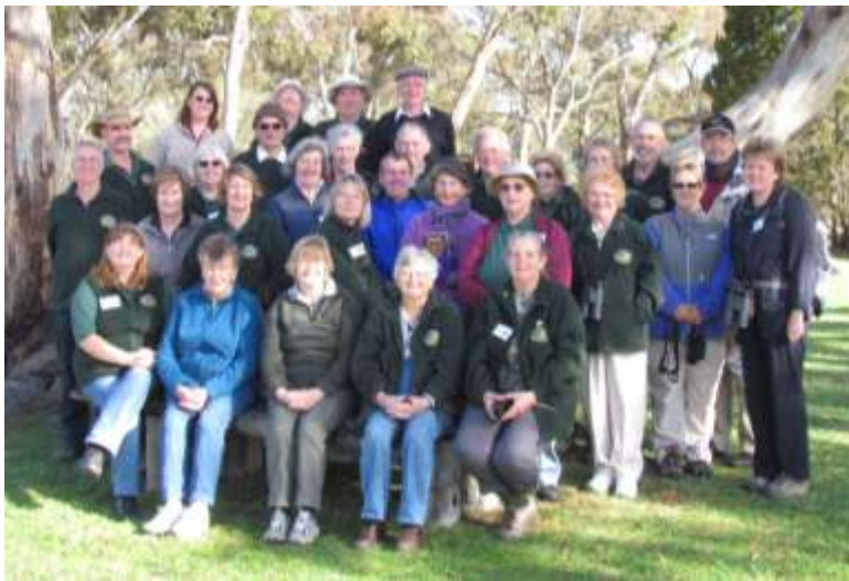
Little Desert October 2011 Weekend away