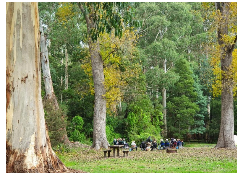
Noojee lunch spot & the path at Toorongo Falls (R)

At 11am we left the car park and drove to our lunch spot at Noojee just over the bridge on the Loch River Road. The environment here is also very attractive amongst very large, tall eucalypts and deciduous trees beside the swiftly flowing La Trobe River. Kookaburras, Spinebills, Wattlebirds and Pied Currawongs were all seen.