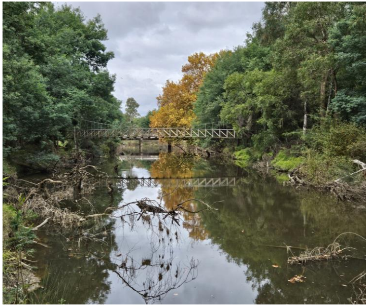
Debris from flooding at Yea Wetlands

We were greeted by picture perfect weather with the wetlands looking green and vibrant, and the billabongs containing good levels of water. The wetlands had been inundated in several recent floods, the last one in January. Some of the boardwalks had sustained damage, but there was only a minor section of the paths that was closed, and we easily skirted around that section.