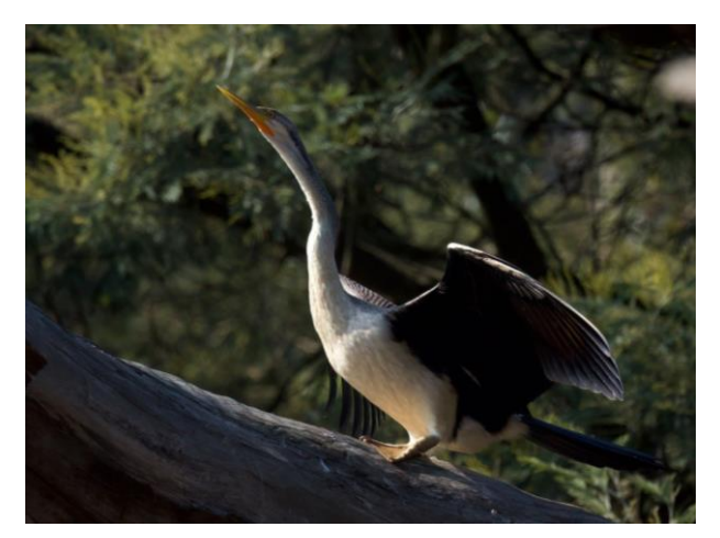
Australasian Darter (ED)