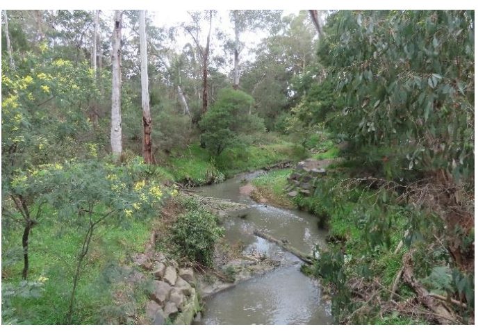
Mullum Mullum Creek