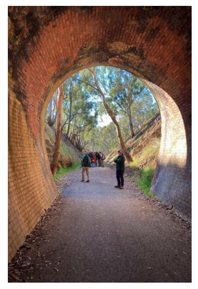
Cheviot Tunnel