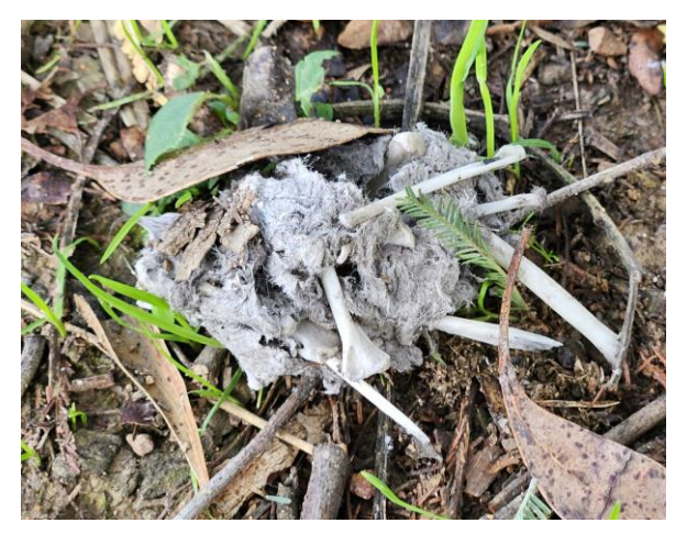
Pellet from the Barking Owl

Moving on, we navigated most of the trails across the reserve, without finding any more owls, however we saw good numbers of other bush birds such as Superb Fairy-wrens, Eastern Yellow Robins and Red-browed Finches. As it turned out, the billabongs themselves didn't have much by way of birdlife, save for a few ducks here and there and a Darter enjoying the sunshine. We managed just under 40 bird species.